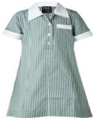
Green Checkered Dress