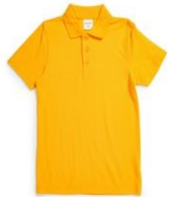
Yellow Polo Shirt