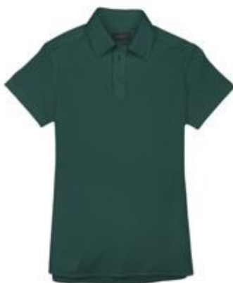
Green Polo Shirt