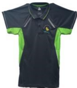
School Polo Shirt