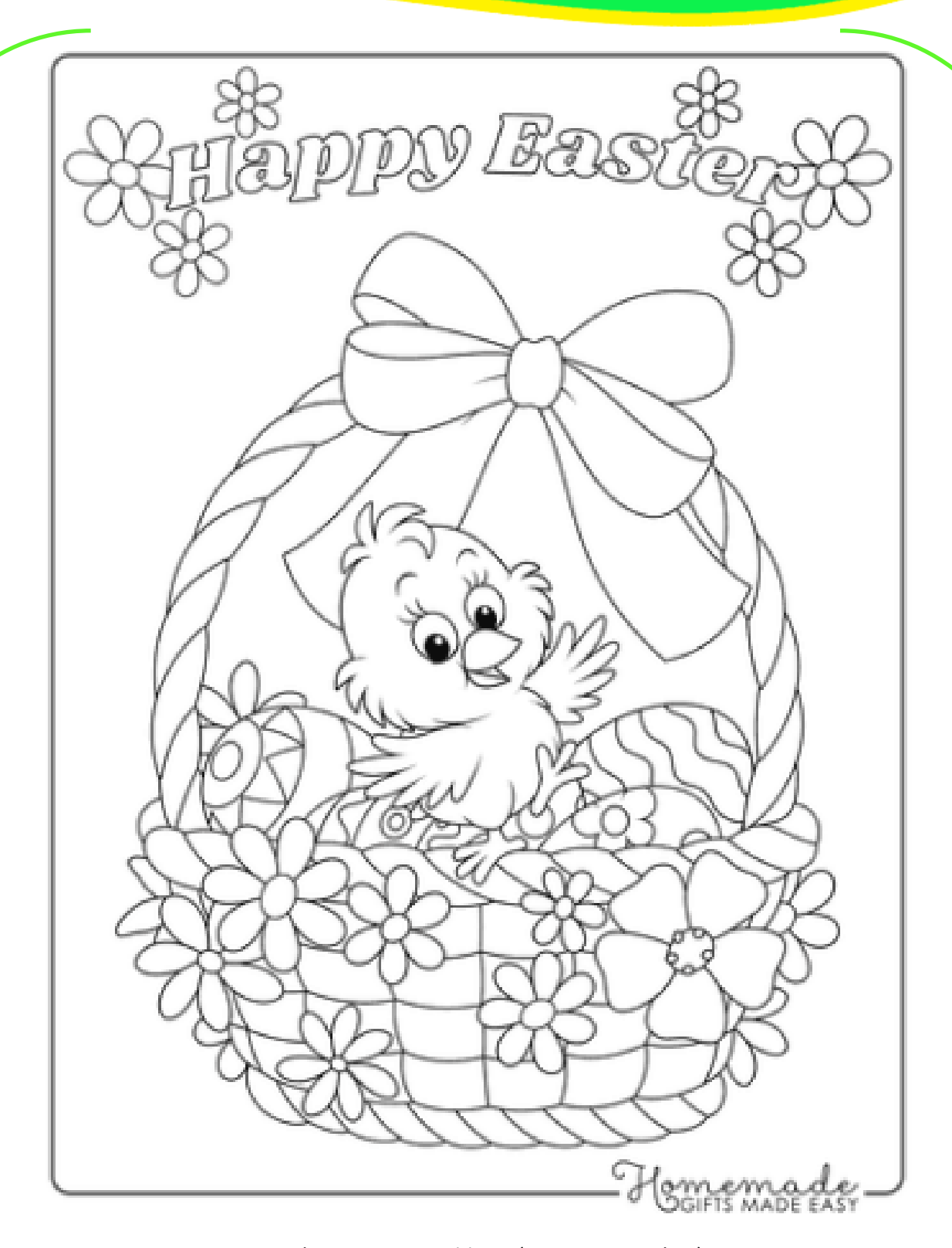
Easter Coloring In Competition—(1 Winner per Class)