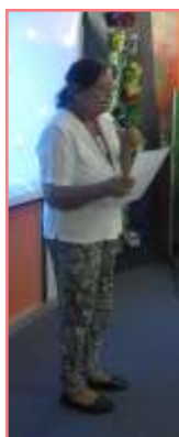
Nan welcomed everyone to country.